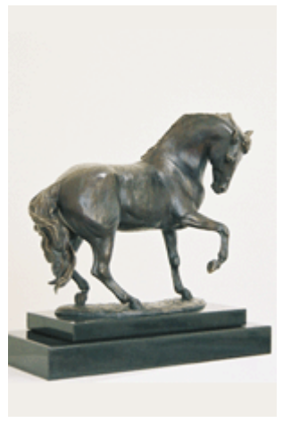
View the Art of Patricia Borum