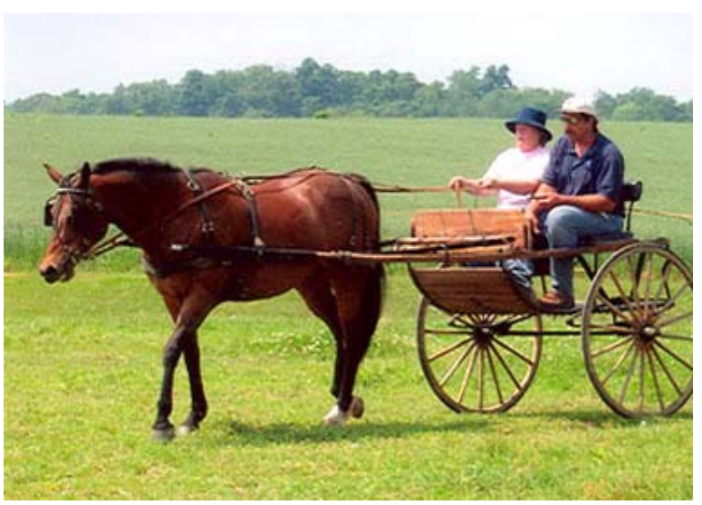
Many OPRC chapters offer driving clinics

"Our chapter includes 50 to 60 members, ages 23 to 60-ish. We talk to the group at meetings and if there's enough interest [in an activity], we assign an organizer. It's up to the organizer to make it happen.